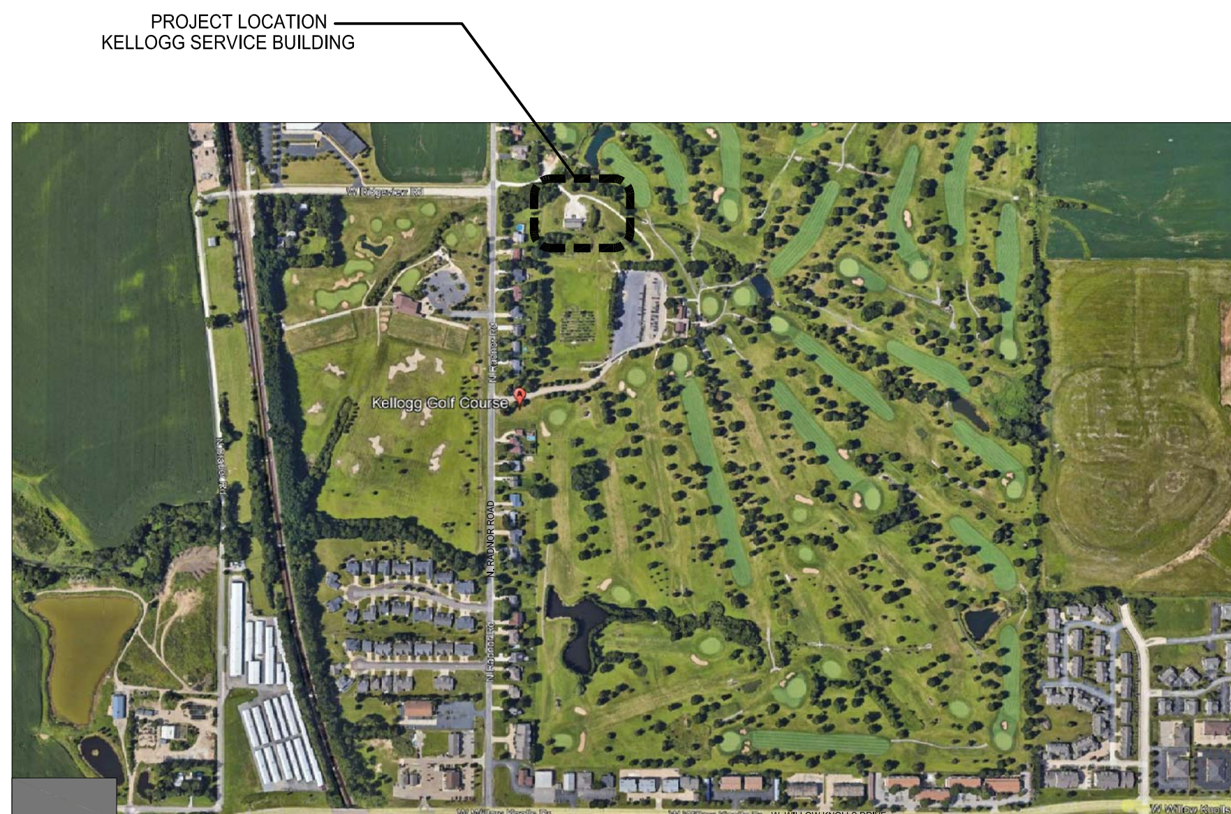
Location in City NO SCALE