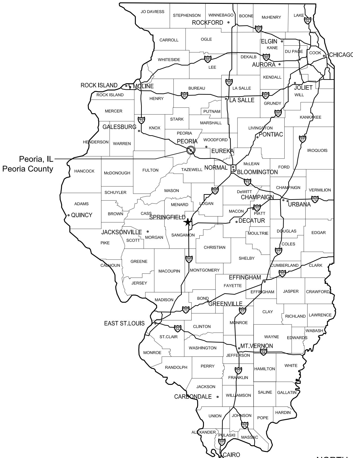
Location in State NO SCALE

A1 - EXISTING/REVISED BOARDWALK PLAN AND TYPICAL SECTION