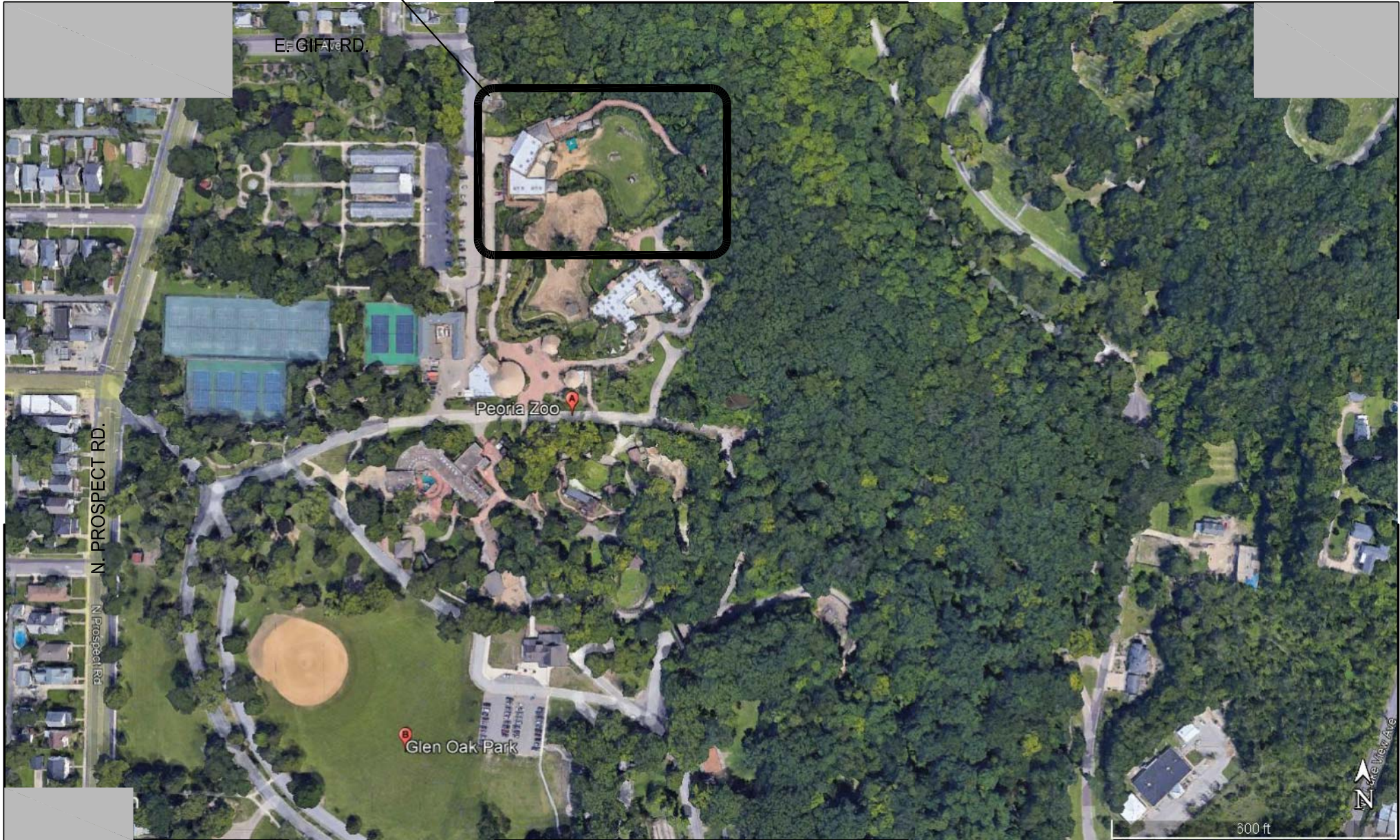
Location in City NO SCALE