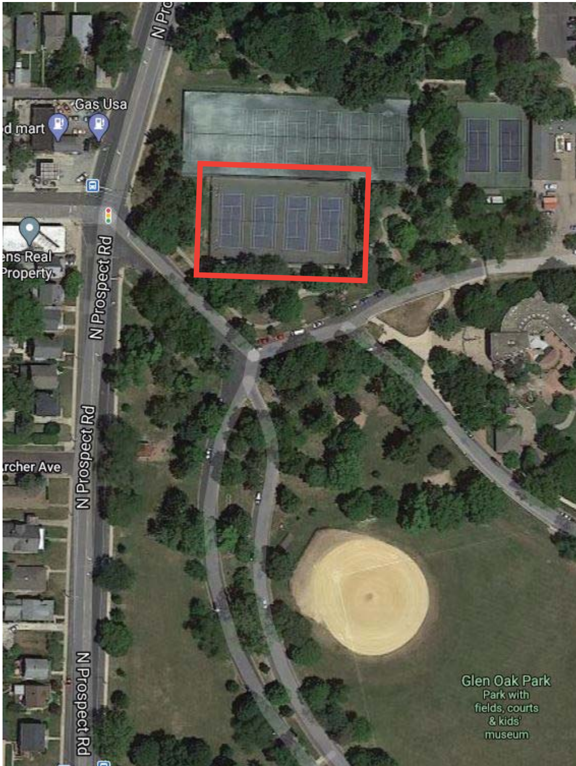
Project Location Map Tennis Court Surface Improvements Glen Oak Park March 23, 2021 Not to Scale