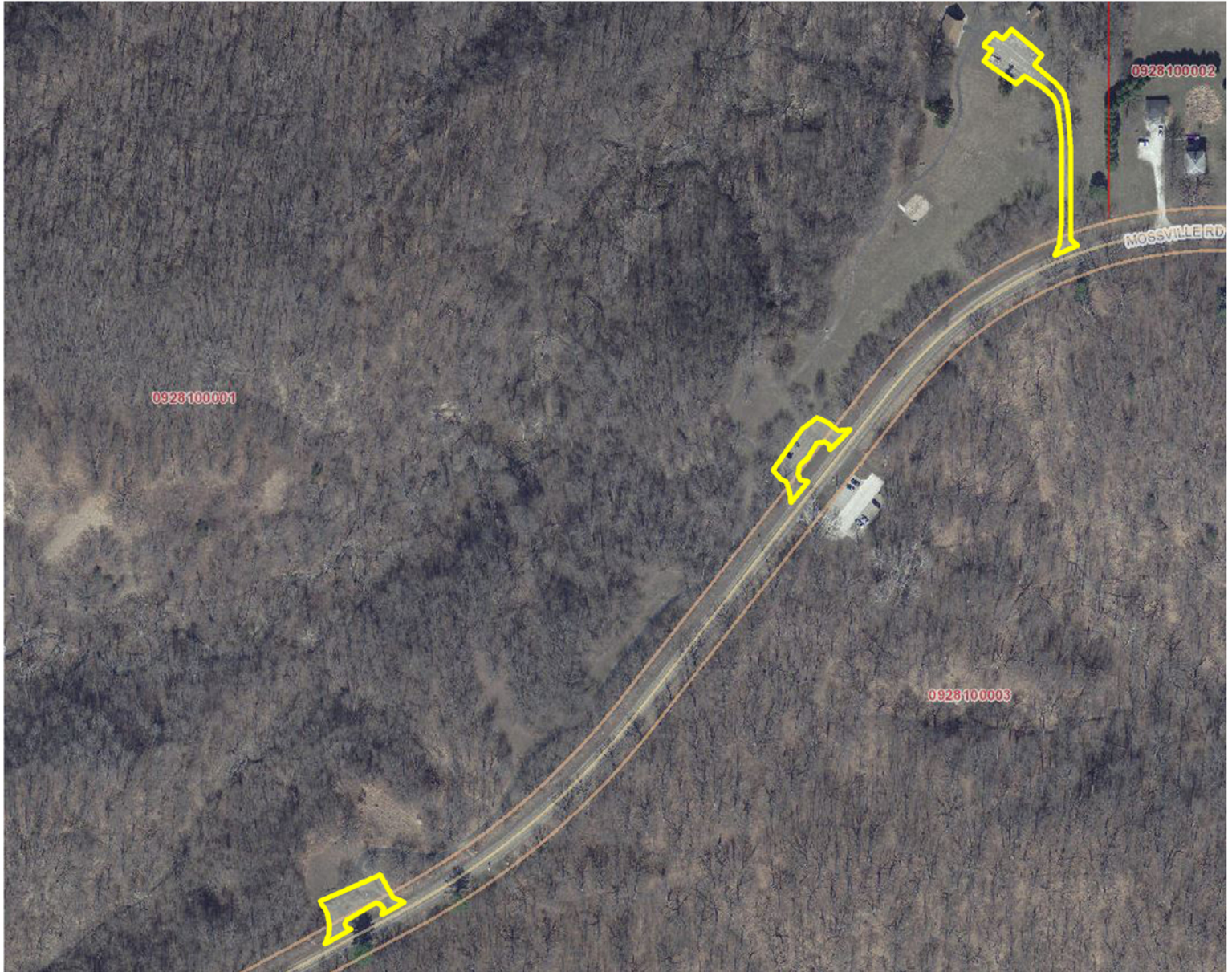
Location Map 3