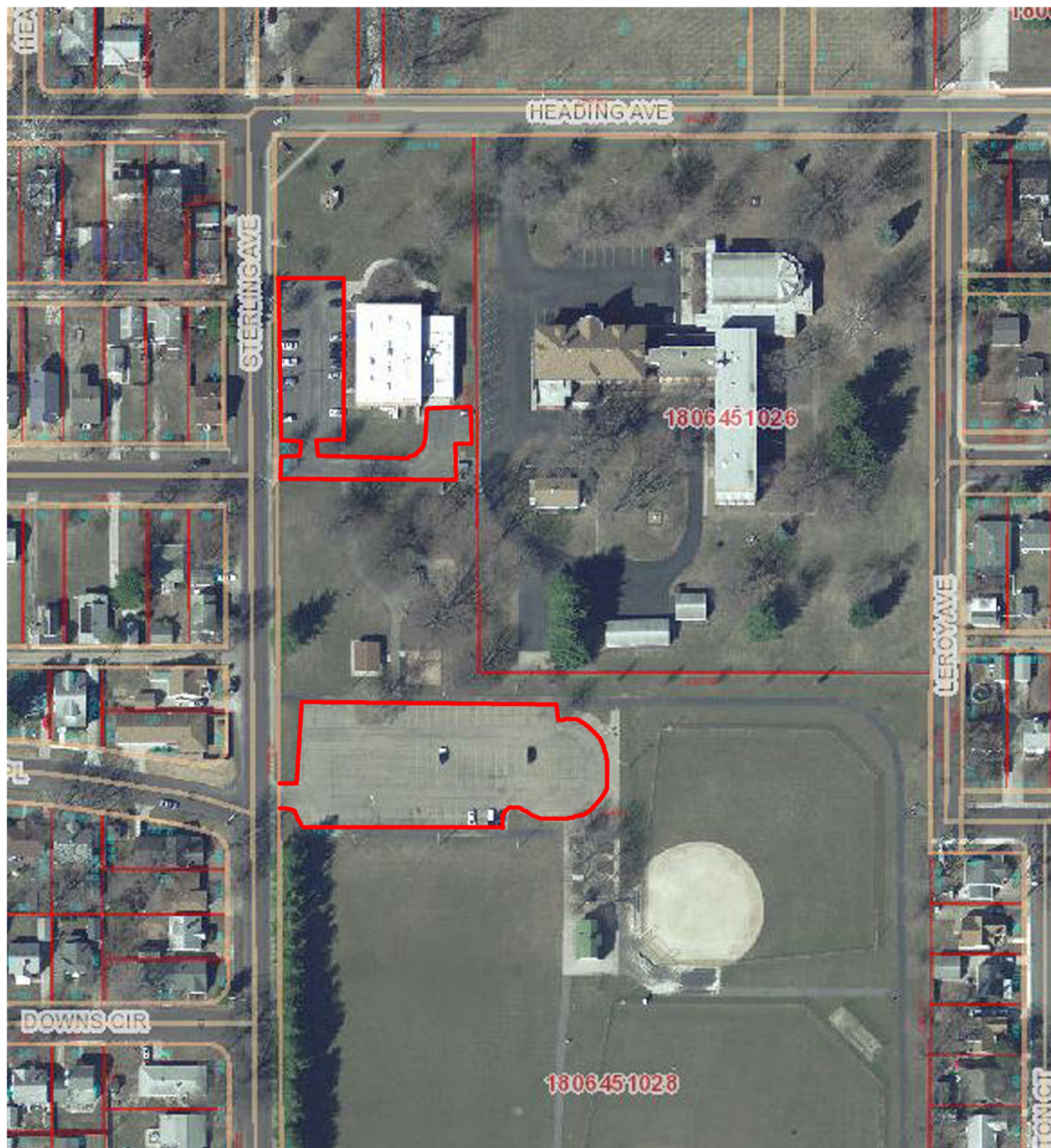
Location Map 1