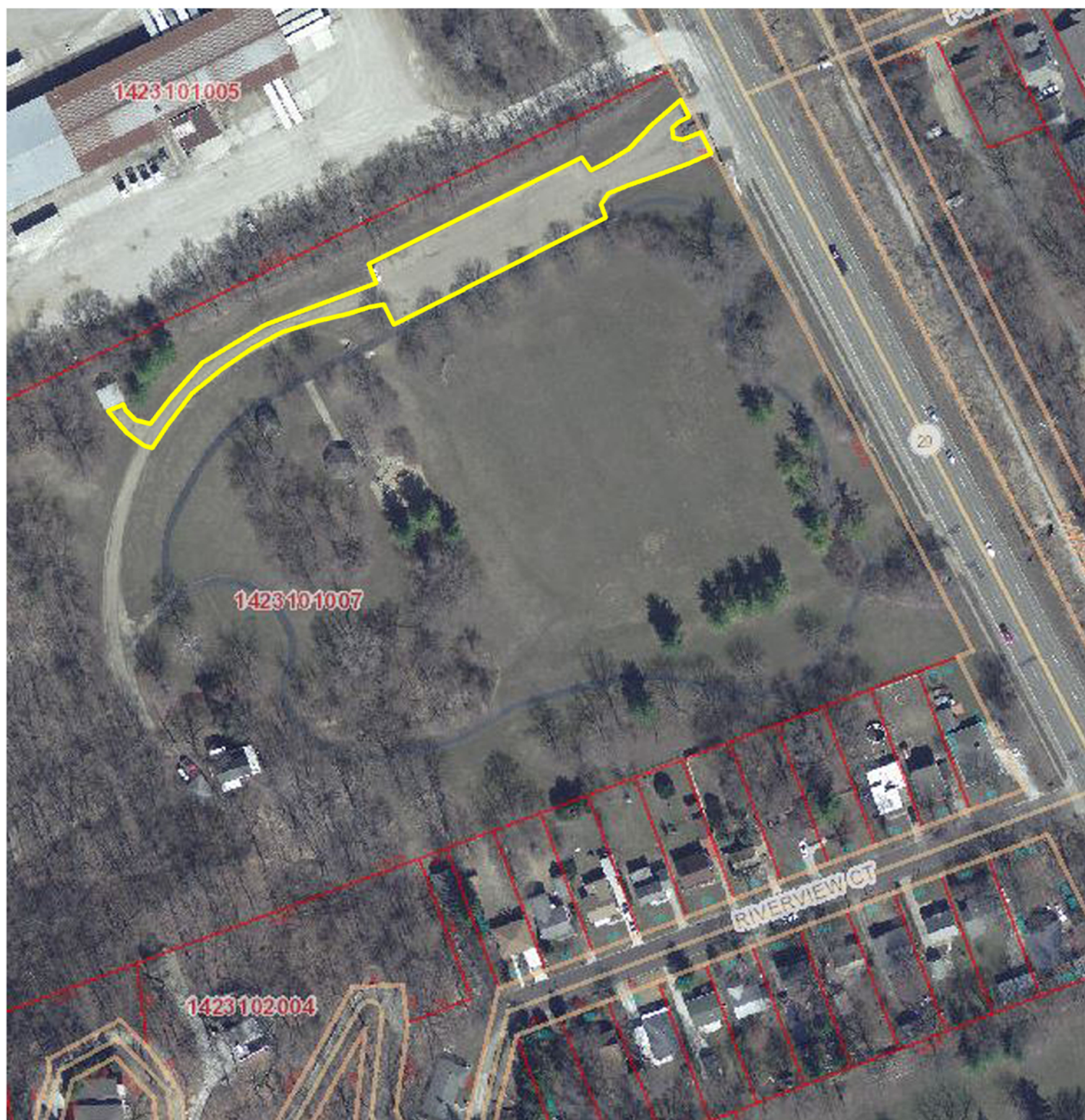
Location Map 2