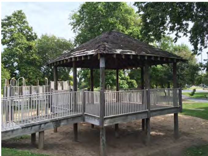
John Gwynn Park Habidek Roof Removal & Replacement Location Plan September 23, 2016