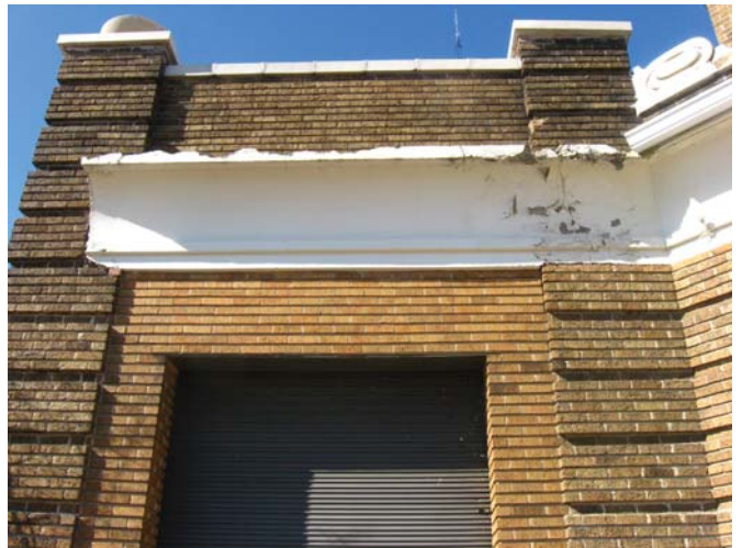
Ledge over east garage door.

Project Location and Images Madison Golf Course Concrete Ledge Restoration March 10, 2015