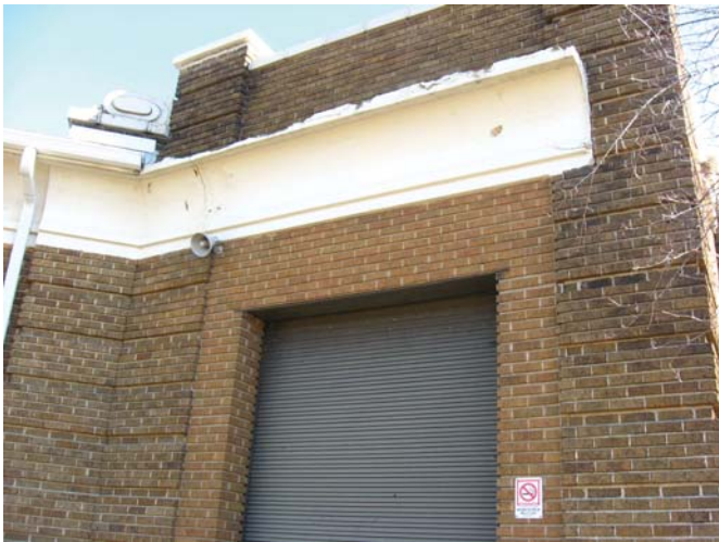
Ledge over west garage door.

Edit in Google Map Maker | Report a problem | X